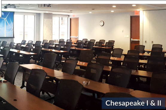
Chesapeake I &amp; II